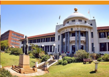
HOWARD COLLEGE CAMPUS