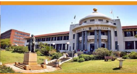
HOWARD COLLEGE CAMPUS