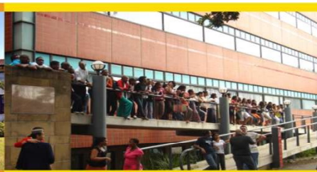
NELSON R MANDELA SCHOOL OF MEDICINE