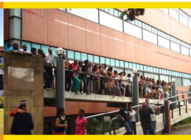
NELSON R MANDELA SCHOOL OF MEDICINE