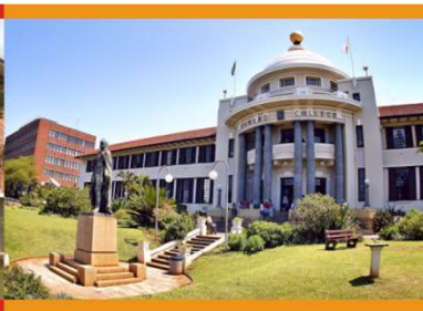
HOWARD COLLEGE CAMPUS